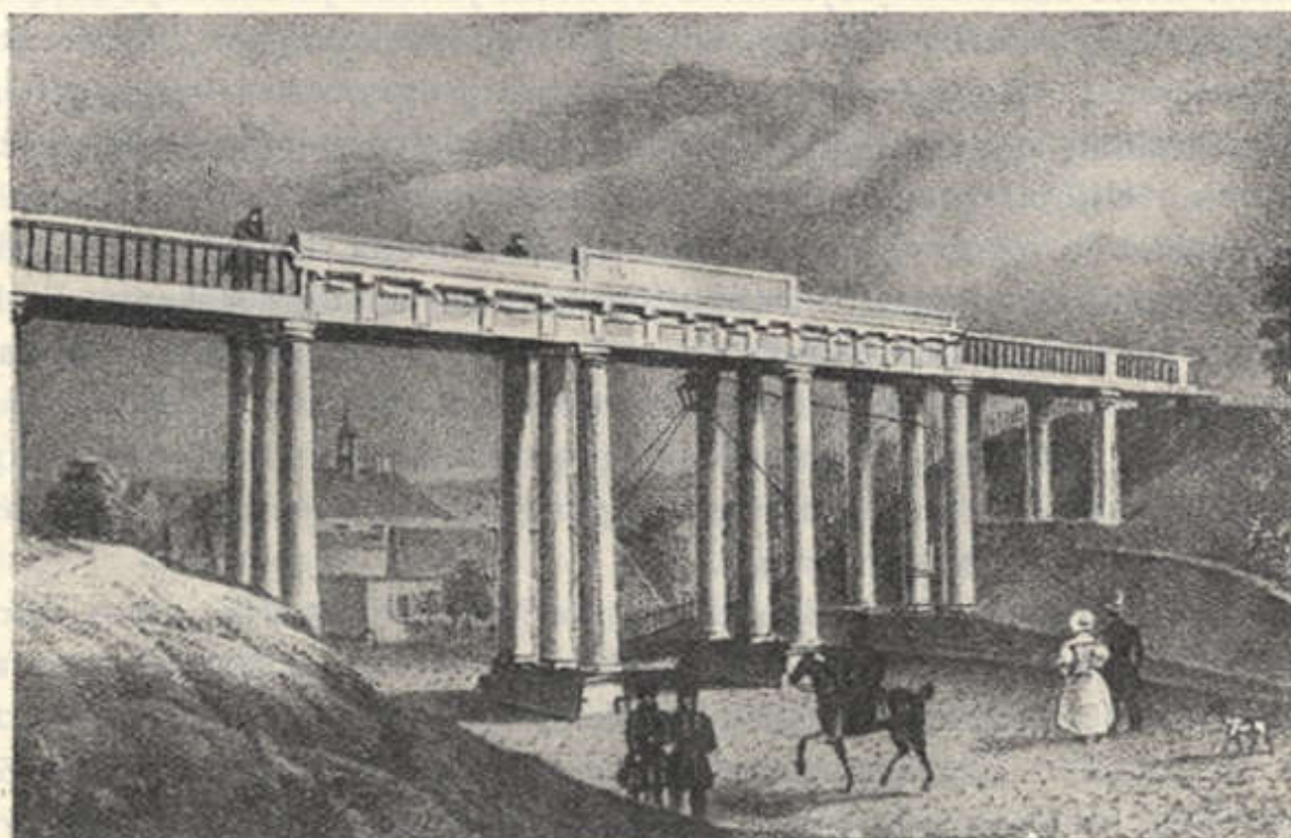
„Inglisild“ 19. sajandi I poolel.